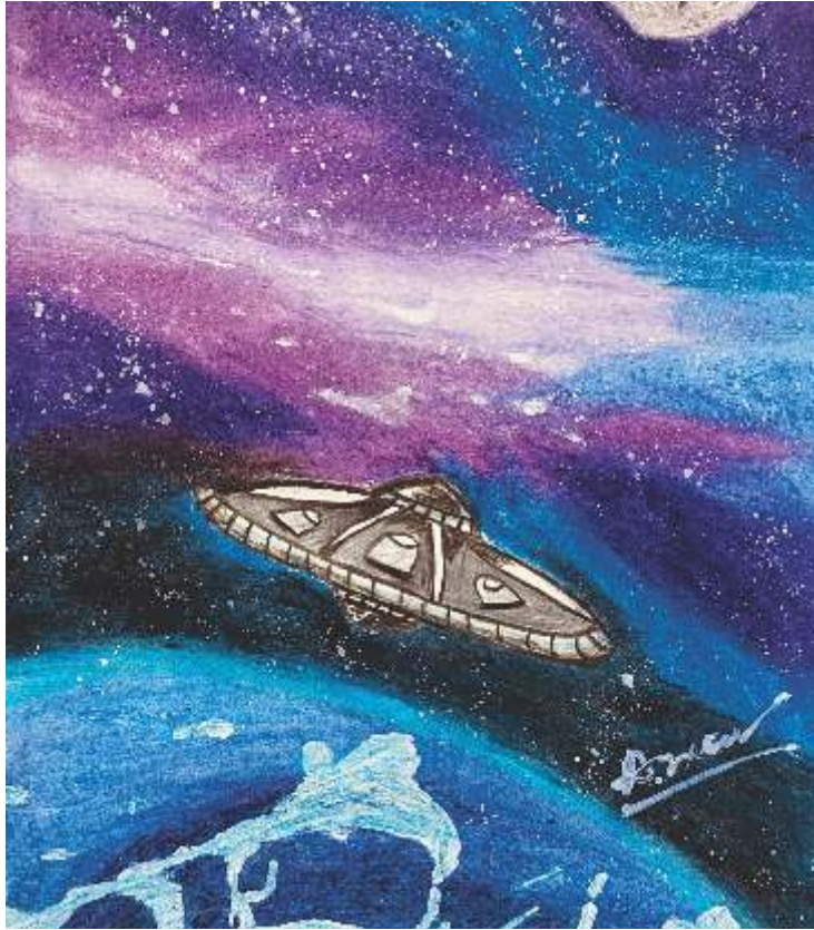
Arnav Ghodke, Student 7D