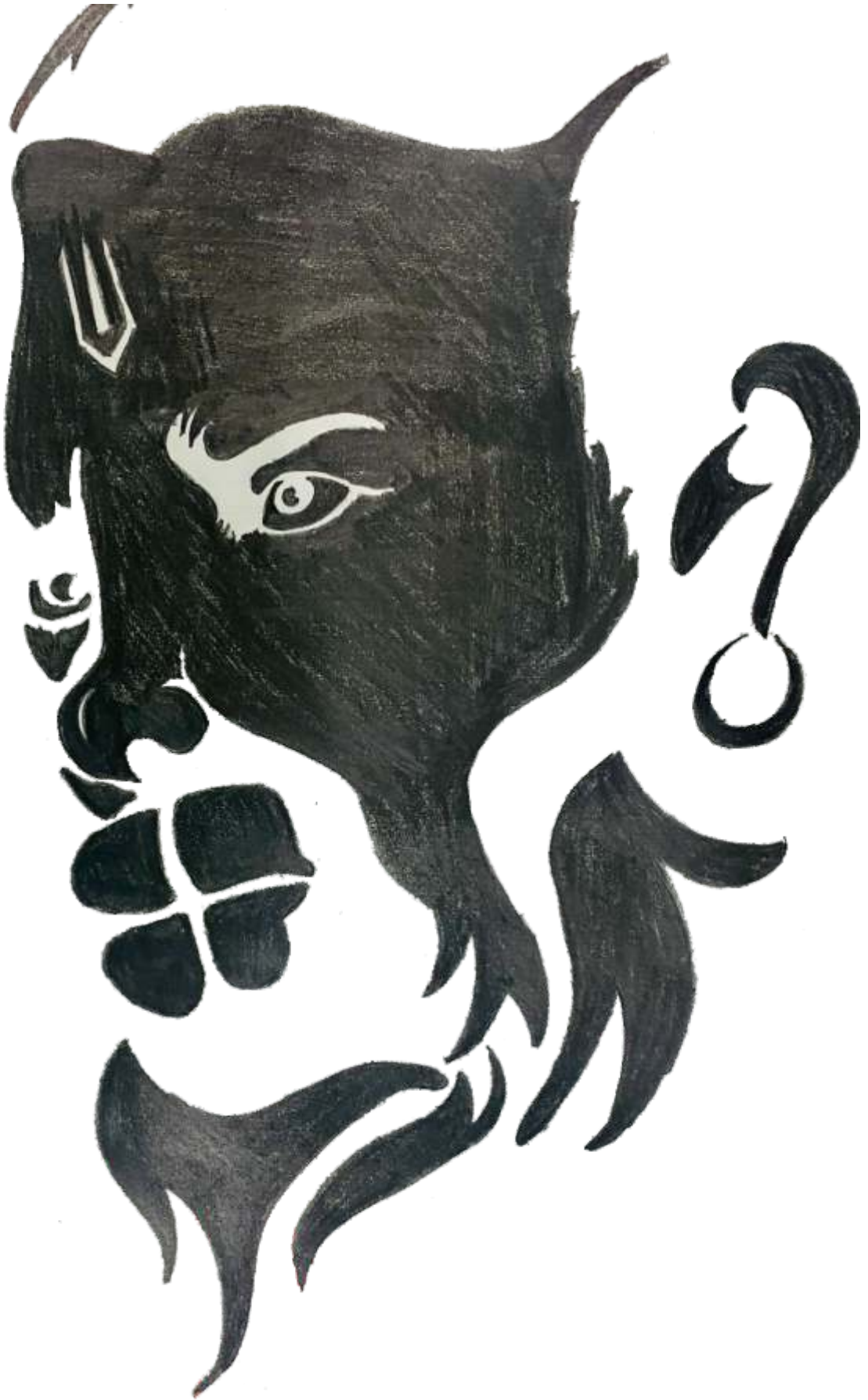
Aryan Shaw, Student 8 Siruis