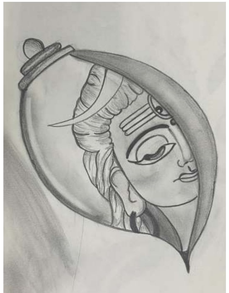
Aryan Shaw, Student 8 Siruis