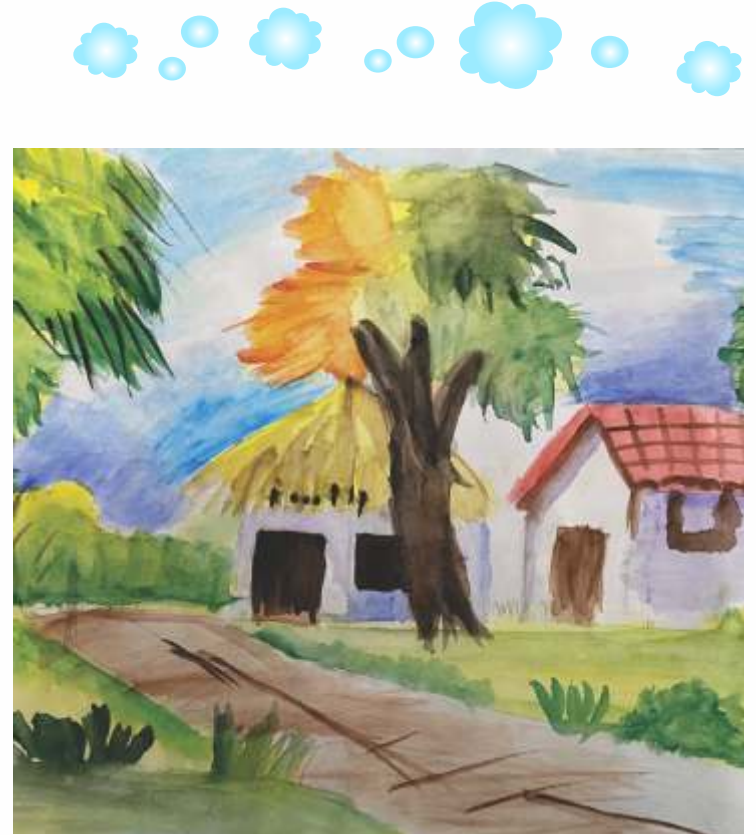
Jiya Soni, Student 7 Rigel