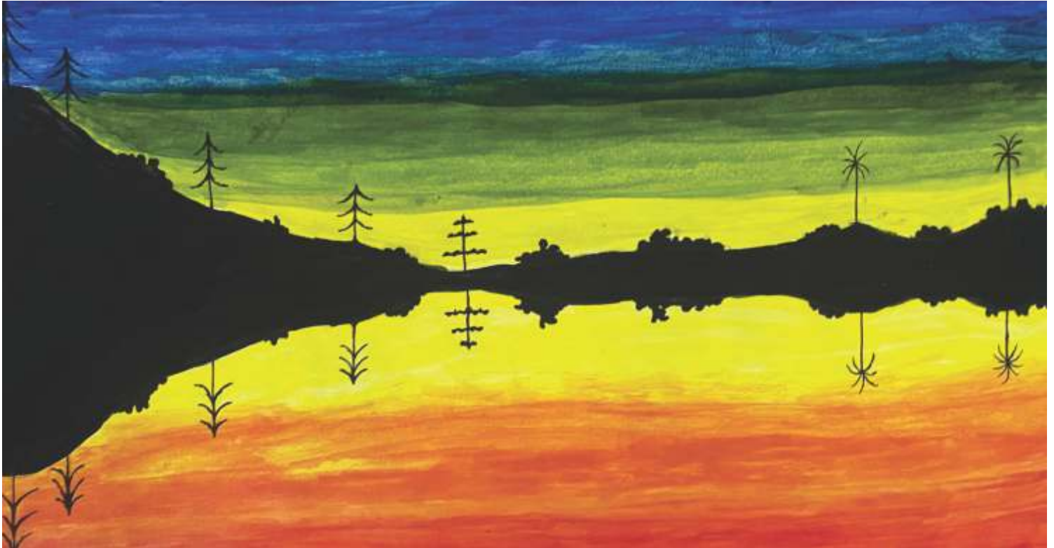
Laksh Aaggarwal, Student 9 Sirius