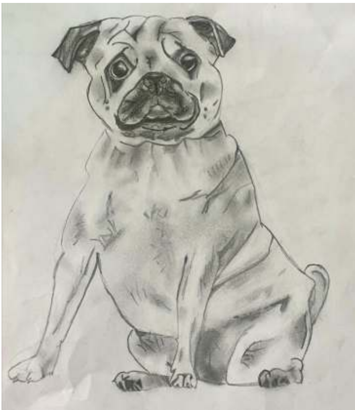
Aarnav Banerjee, Student of 6 Deneb