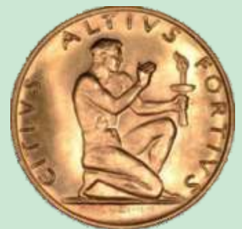
The motto on a 1948 Summer Olympics medal