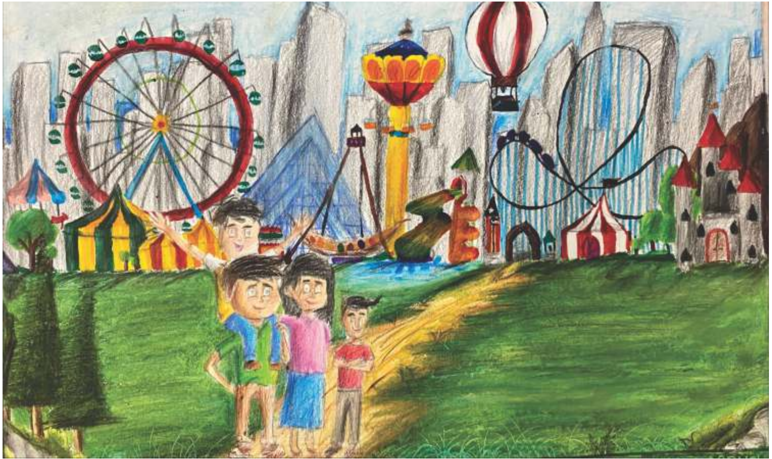
Aadvik Chaudhary, Student 5 Sirius