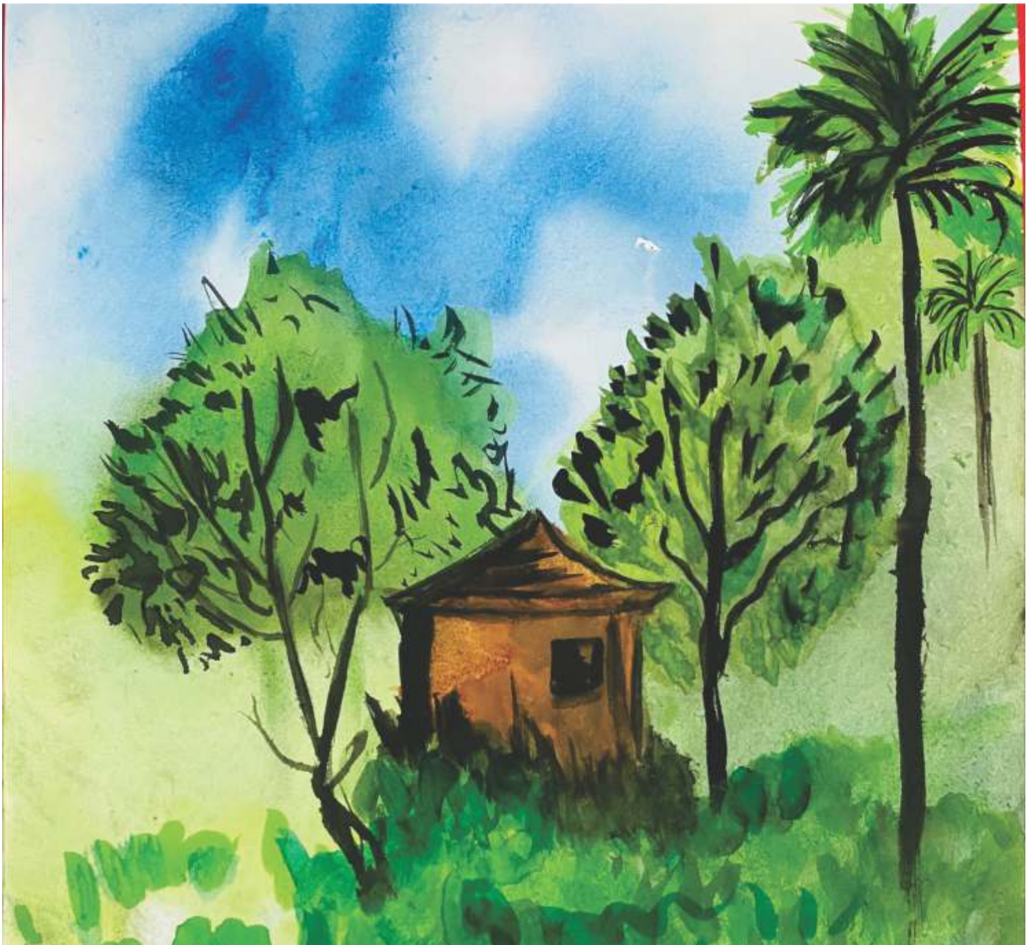
Aryan Shaw, Student 8 Sirius