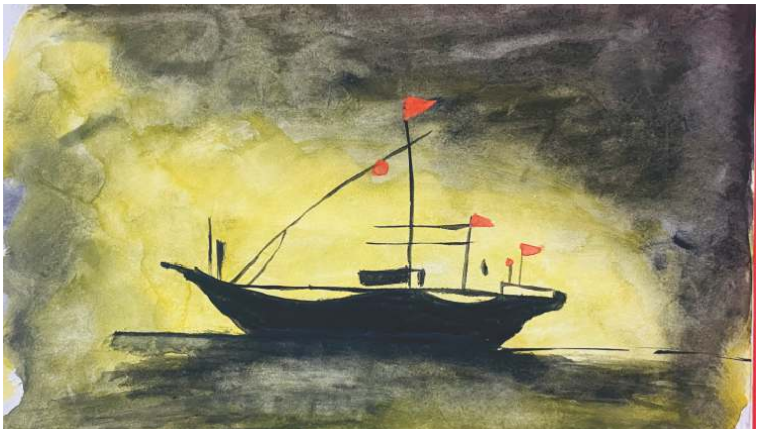
Aryan Shaw, Student 8 Sirius