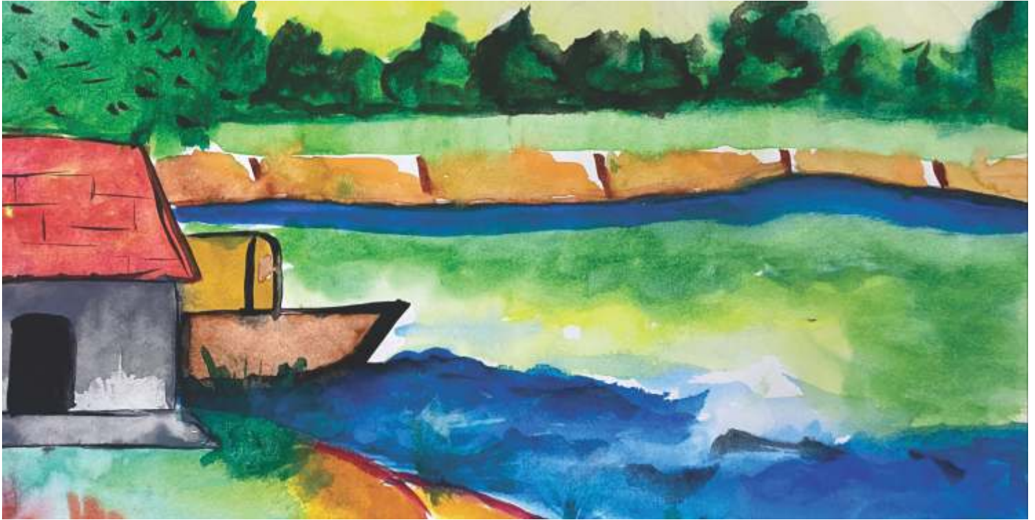
Aryan Shaw, Student 8 Sirius