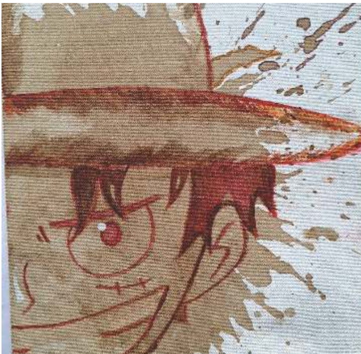
Dhruv Shrivastava 7 Rigel