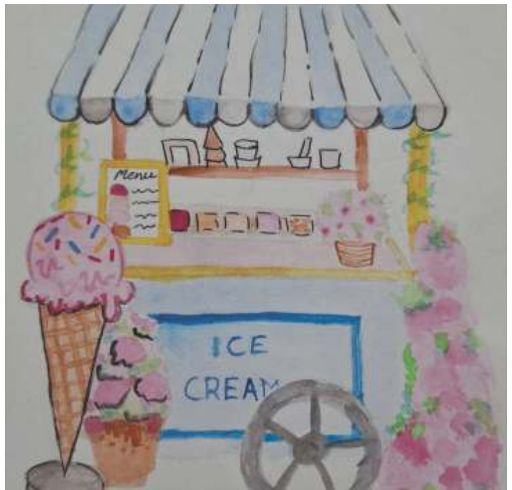
Dnyanada Patil 8 Sirius