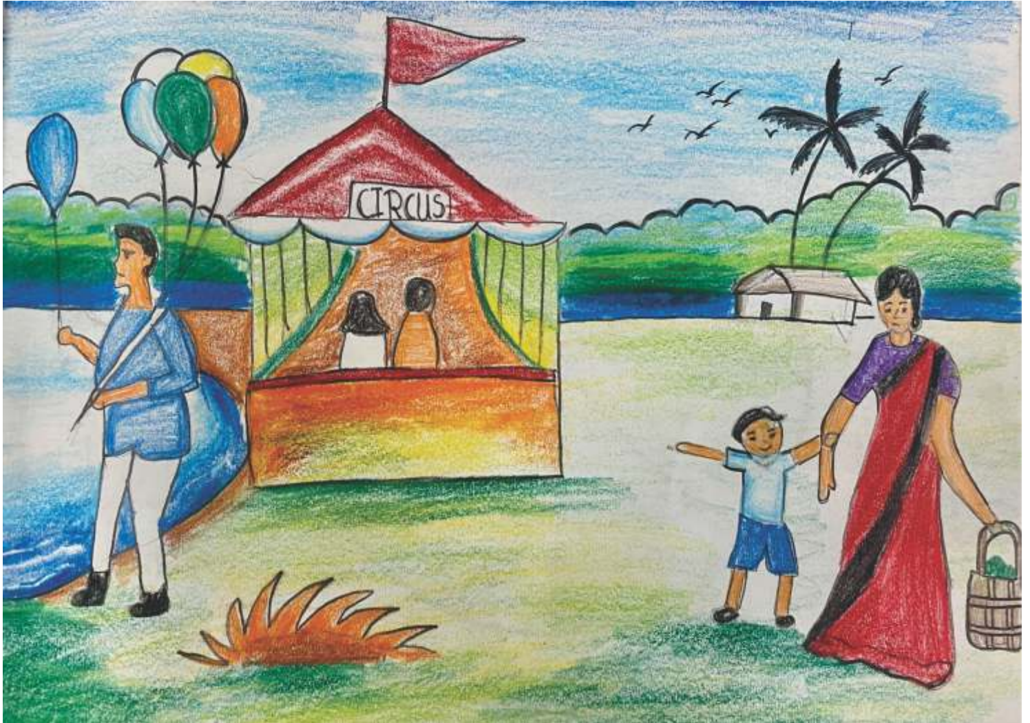
Hridhaan Das, Student 4 Sirius