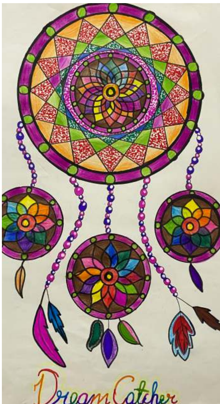
Haripriyaa - 6S