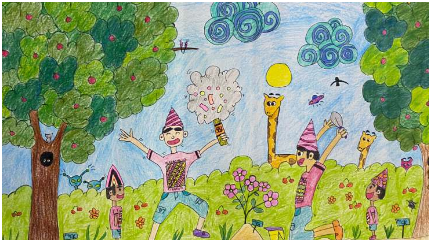
Shashwat Kelzarkar -8S