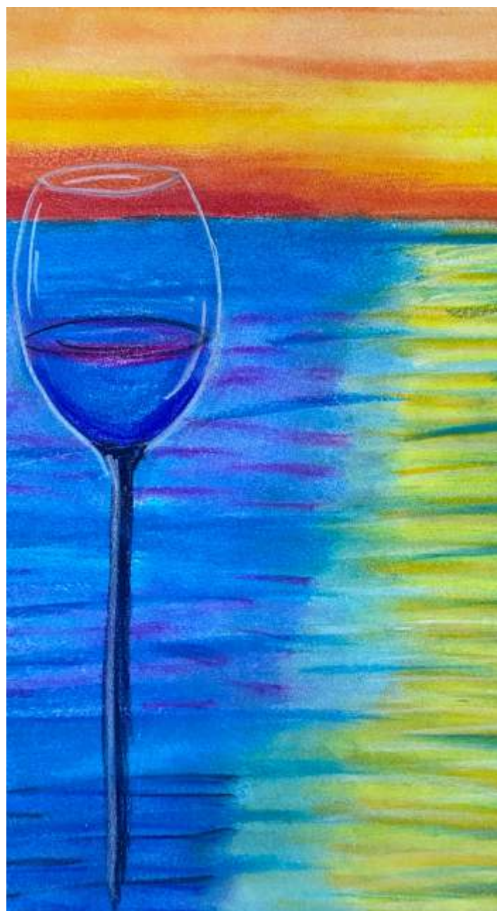
Rashika - 7D