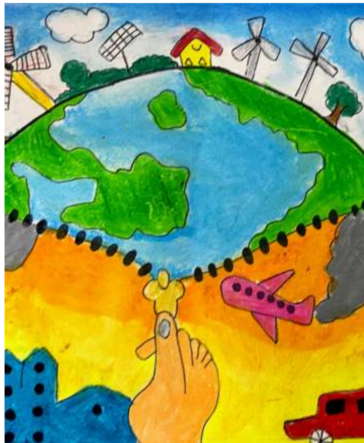
Payal Bajaj - 7S