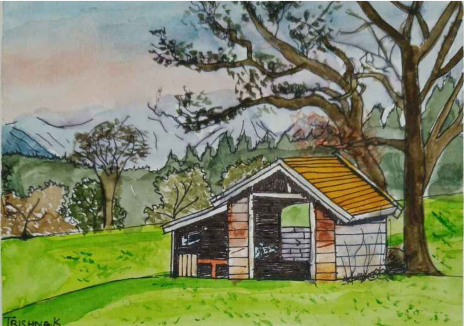
Trishna K 8 Rigel