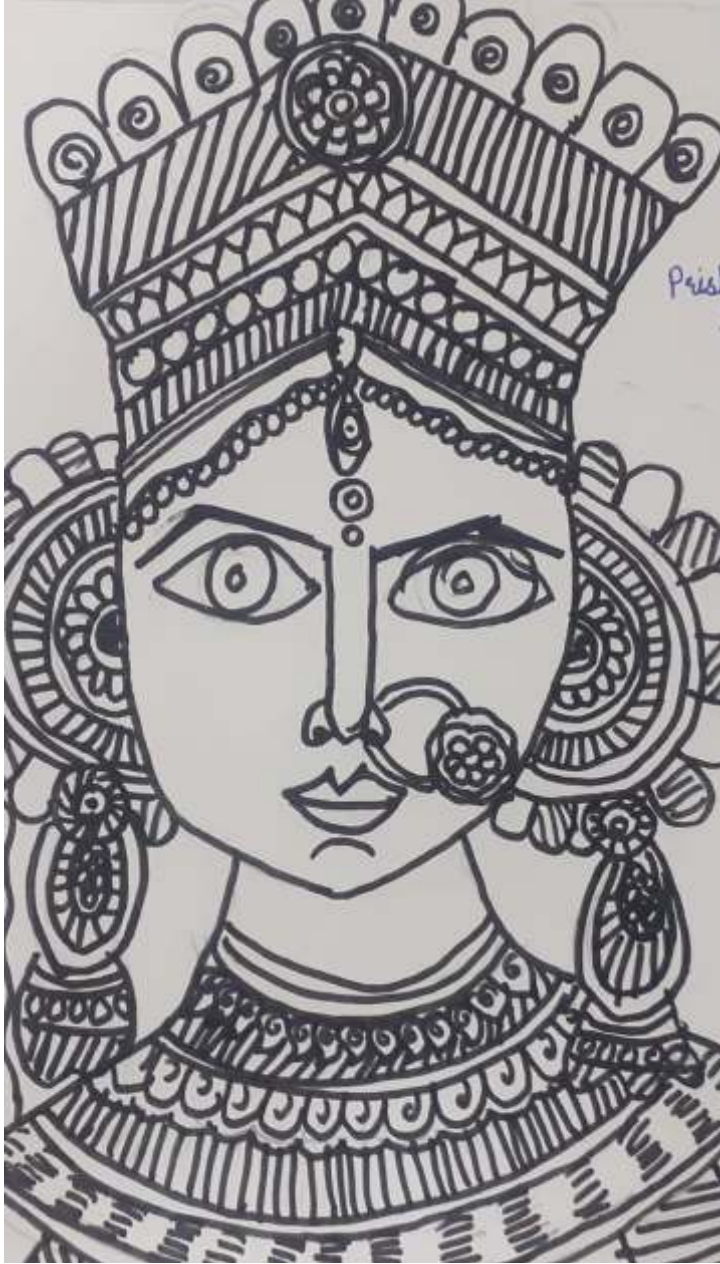
Prisha Oturkar 5 Vega