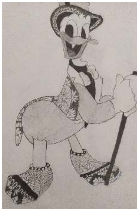
Ishaan Dubey 6 Deneb