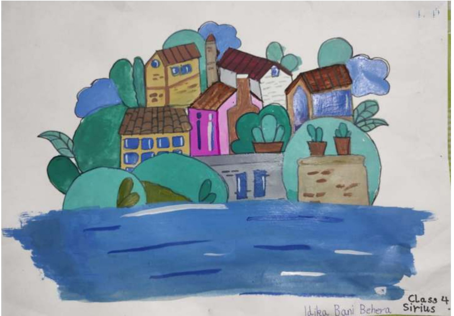
Idika Bani Behera, Student 4 Sirius