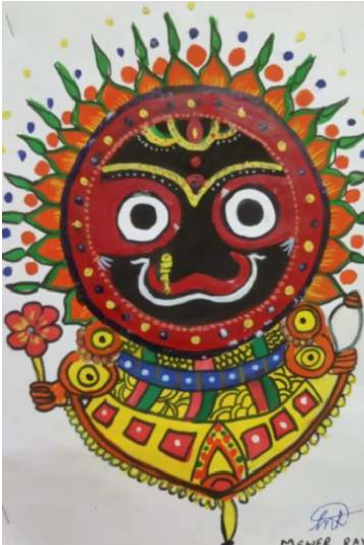
Meher Raval 5 Vega