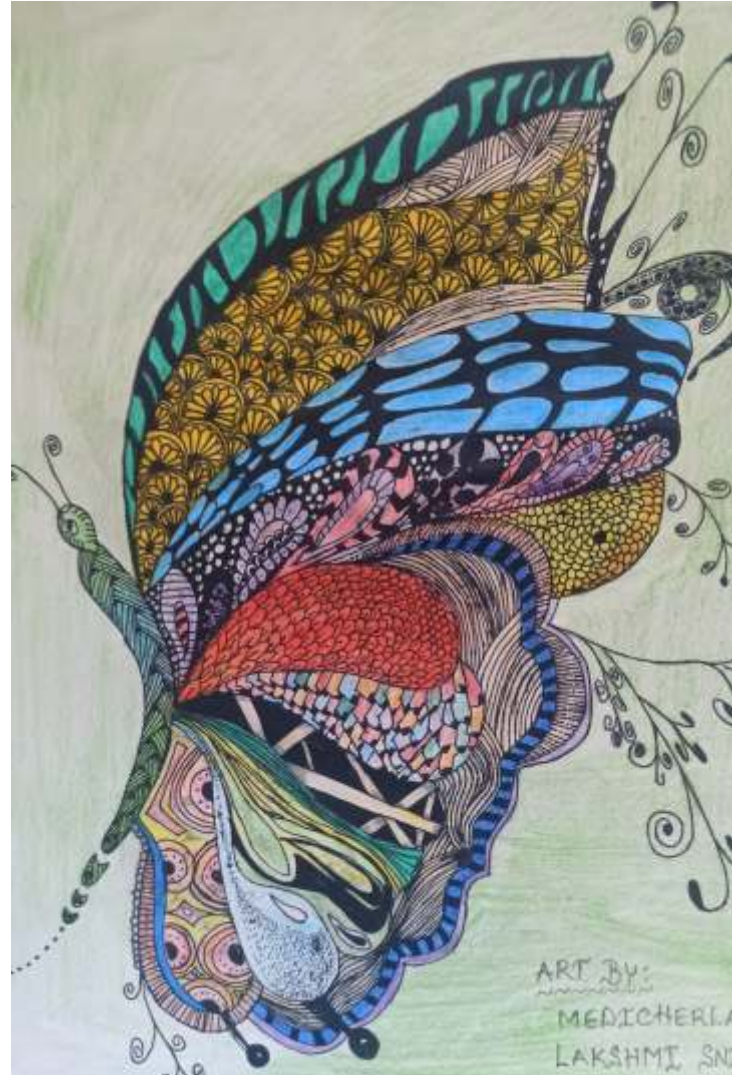
Lakshmi Snikita 9 Vega