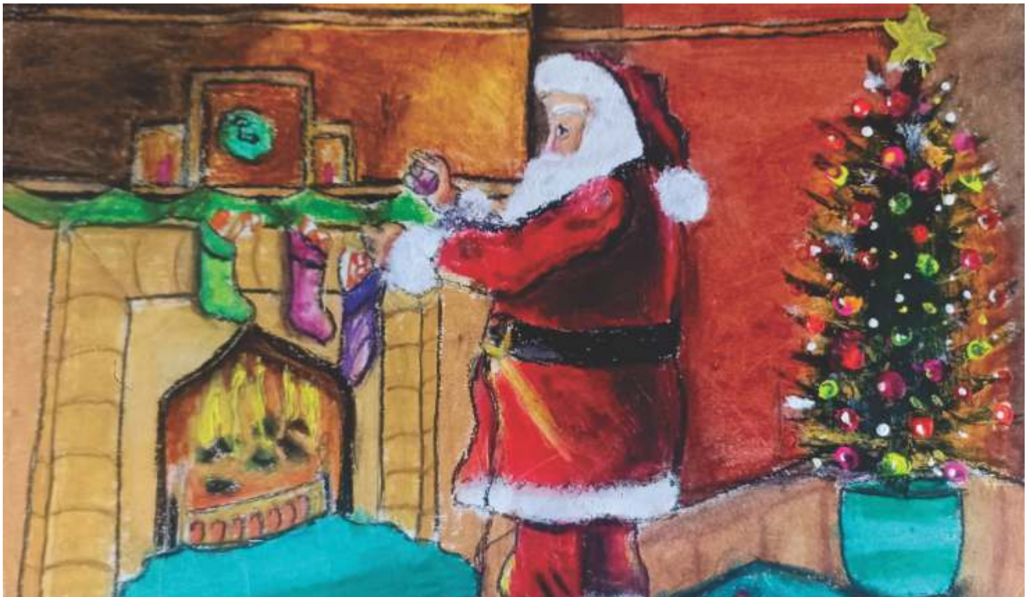
Hasita Gopal Class 4 Vega