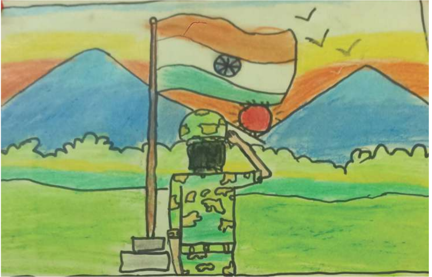
Ojas Shirude class 4 vega