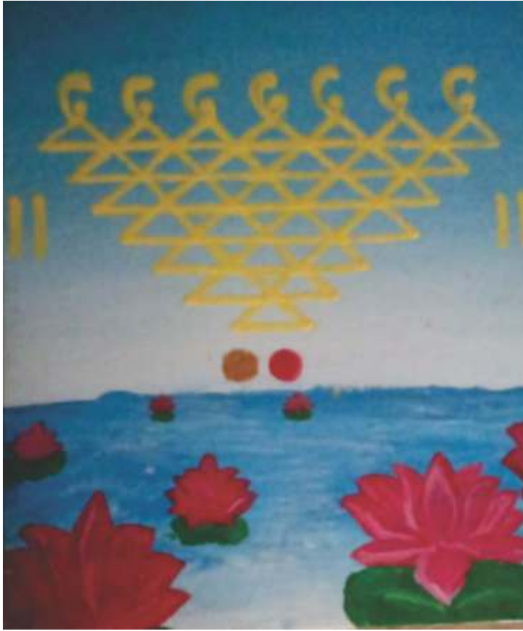
Devashree Dahimiwal Class 5 Vega