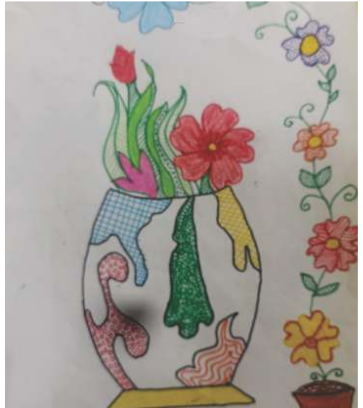
Sumita Singh Class 5 sirius