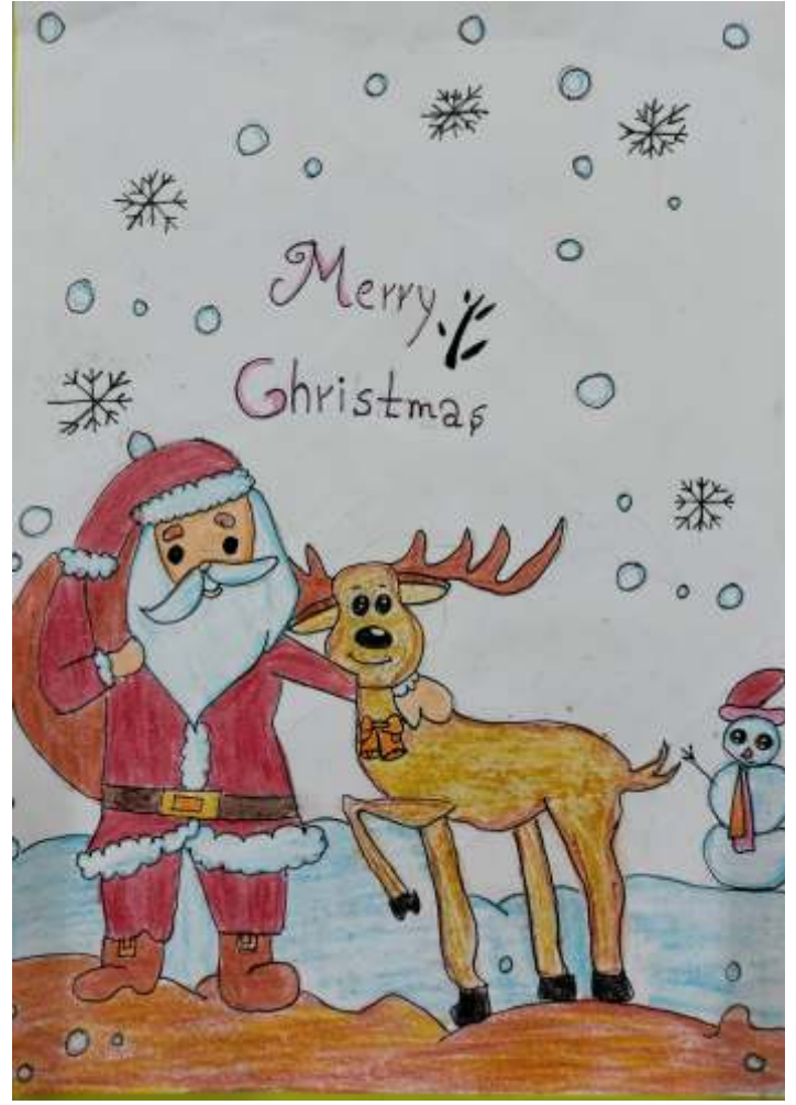
Arjit Hirshkesh Bhujbal Class 3 Vega