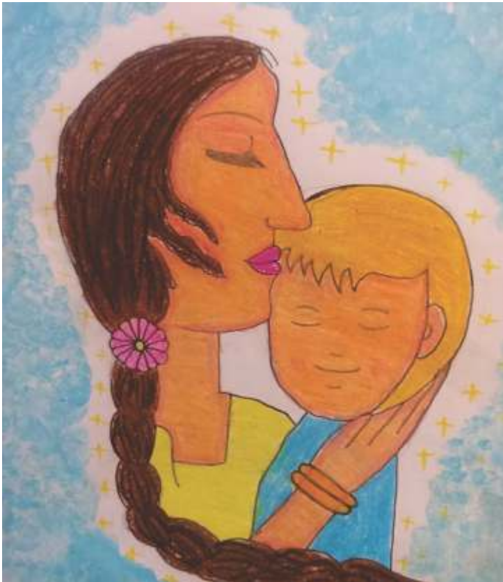
Swara Shah Class 4 Vega