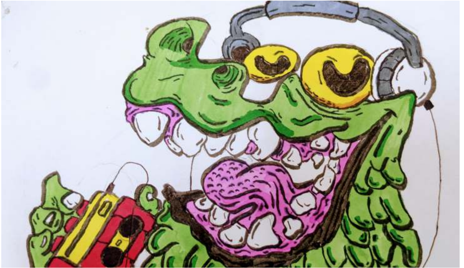
Dhruv Shrivastava - 4 Sirius