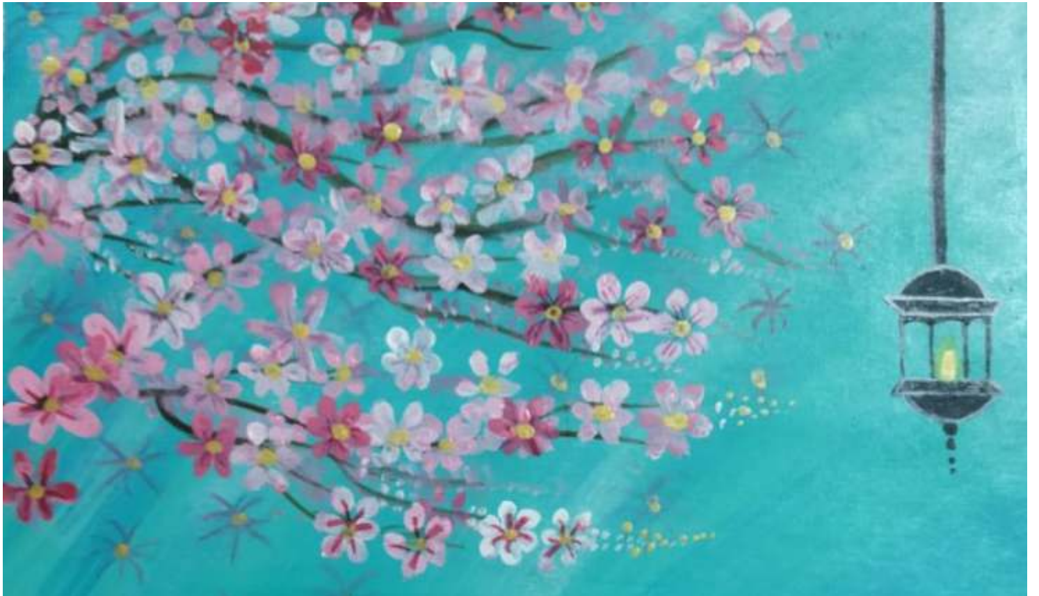
Vaishnavi. P - 9 Rigel