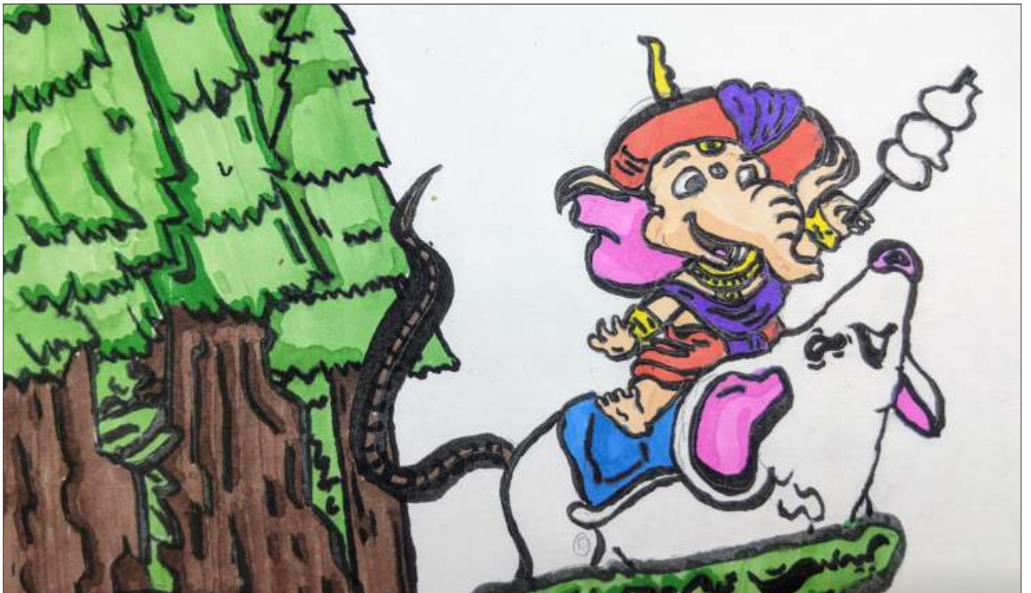
Dhruv Shrivastava - 4 Sirius