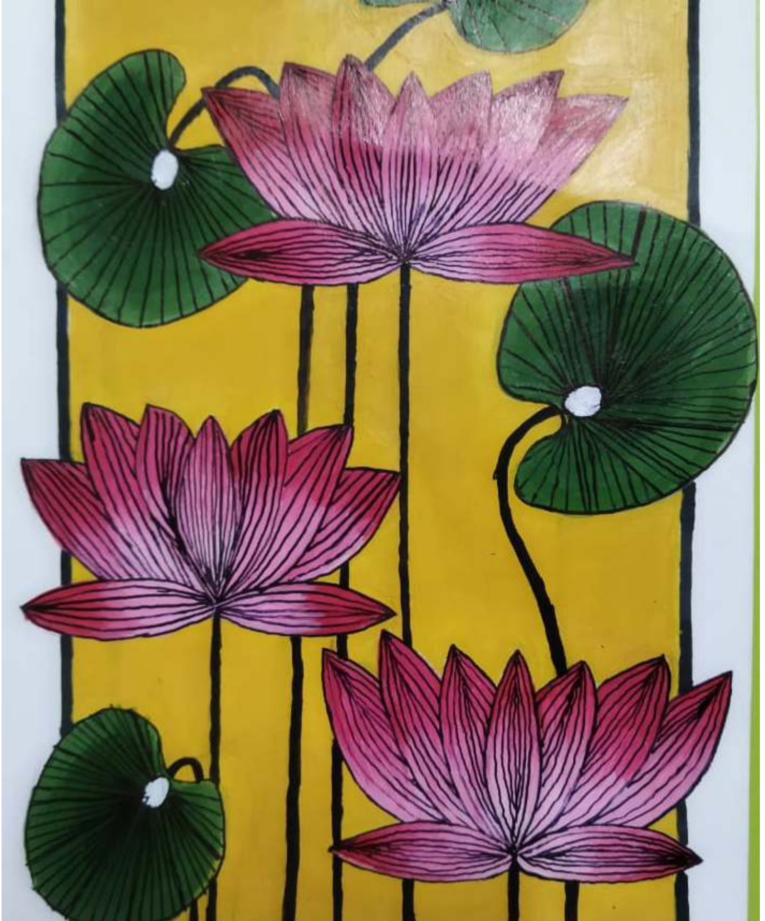
Pryagi - 9 Rigel