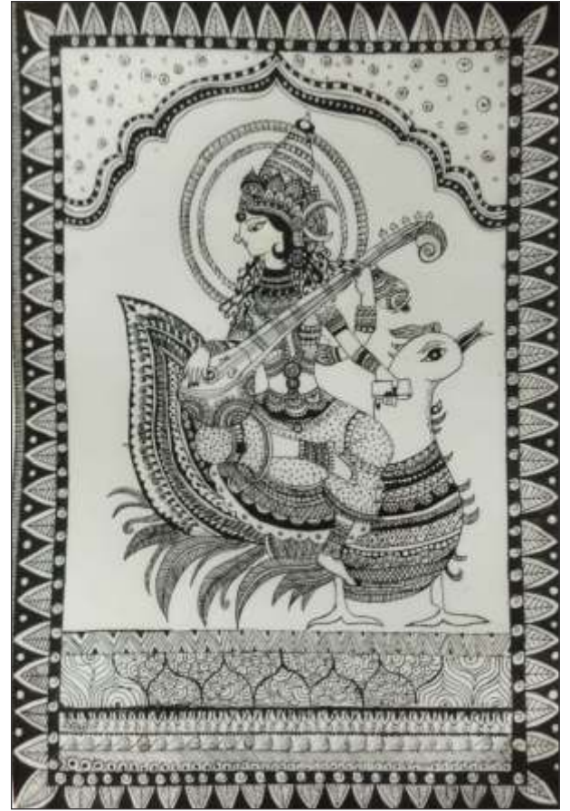
Jyotsana Tiwari - 7 Vega