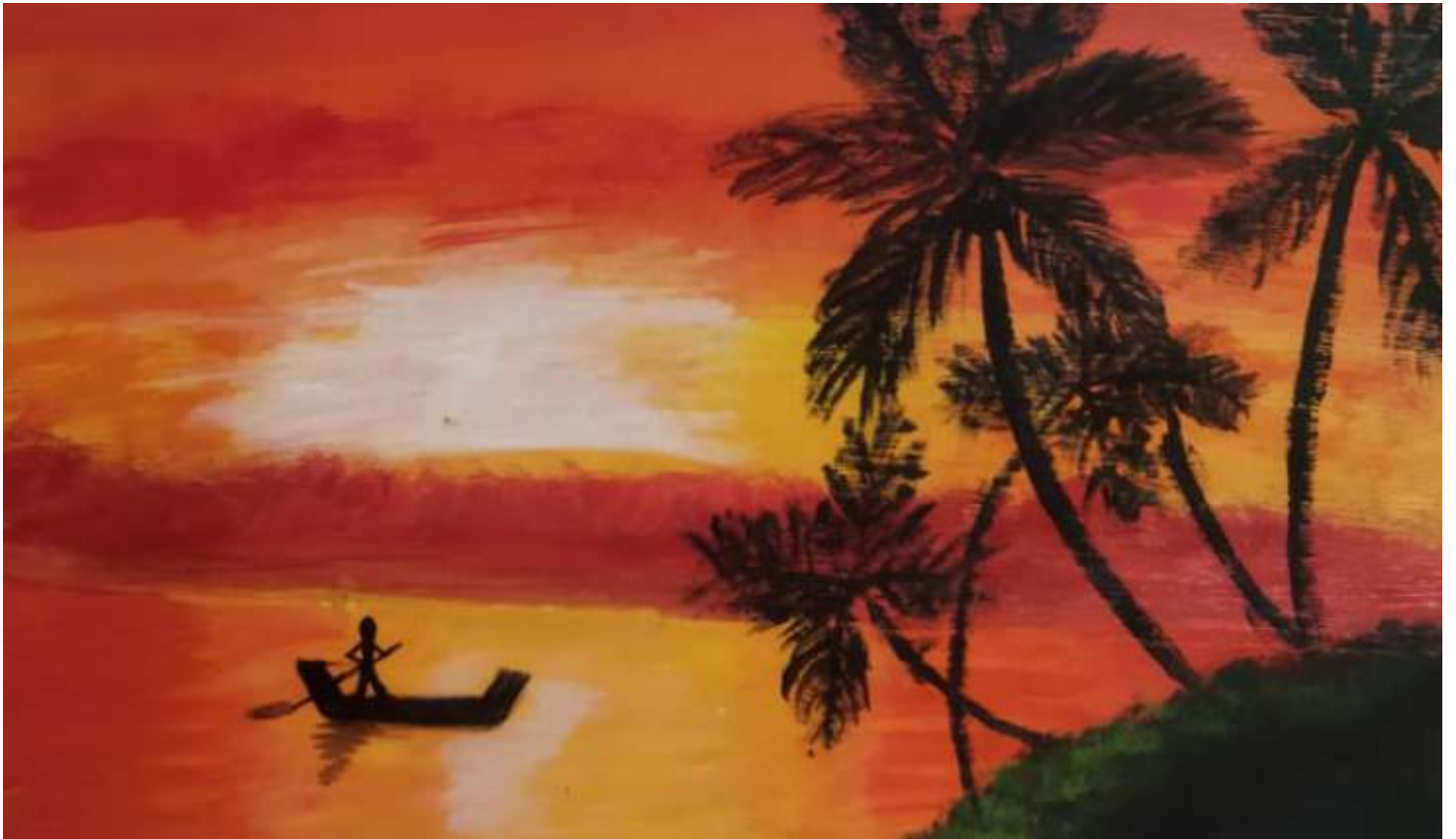
Vaishnavi. P - 9 Rigel