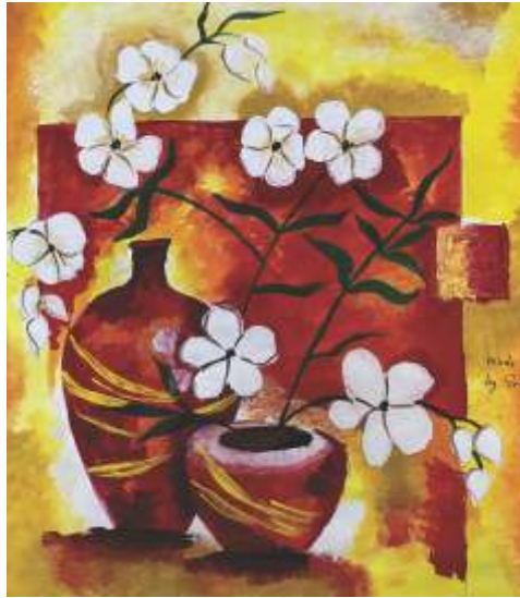
Pratham - 5 D