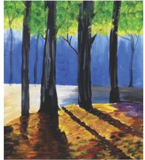
Pratham - 5 D