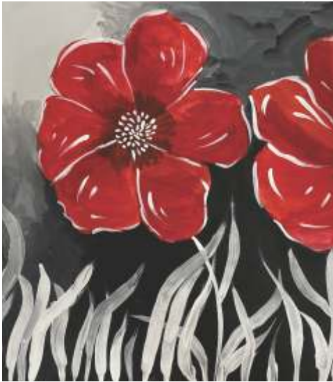
Pratham - 5 D