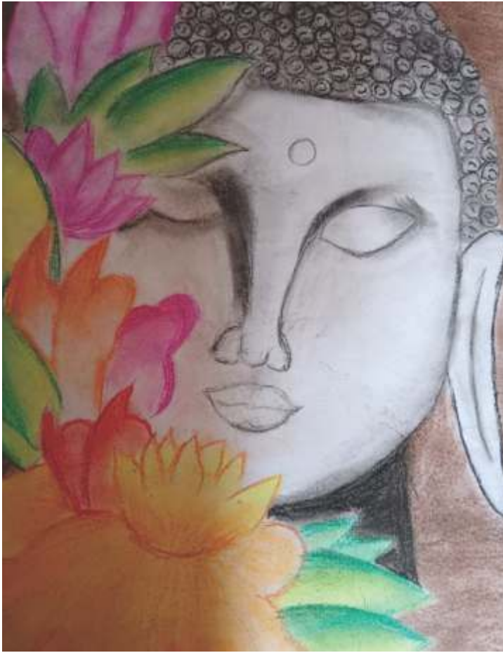
Dhruv Shrivastava Class 6 Antares