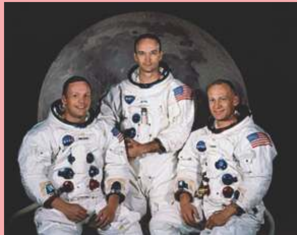
Left to right: Neil Armstrong, Michael Collins, Buzz Aldrin

Apollo 11 (July 16–24, 1969) was the American spaceflight that first landed humans on the Moon. Commander Neil Armstrong and Lunar Module Pilot Buzz Aldrin landed the Apollo Lunar Module Eagle on July 20, 1969, at 20:17 UTC, and Armstrong became the first person to step onto the Moon's surface six hours and 39 minutes later, on July 21 at 02:56 UTC. Aldrin joined him 19 minutes later, and they spent about two and a quarter hours together exploring the site they had named Tranquility Base upon landing.