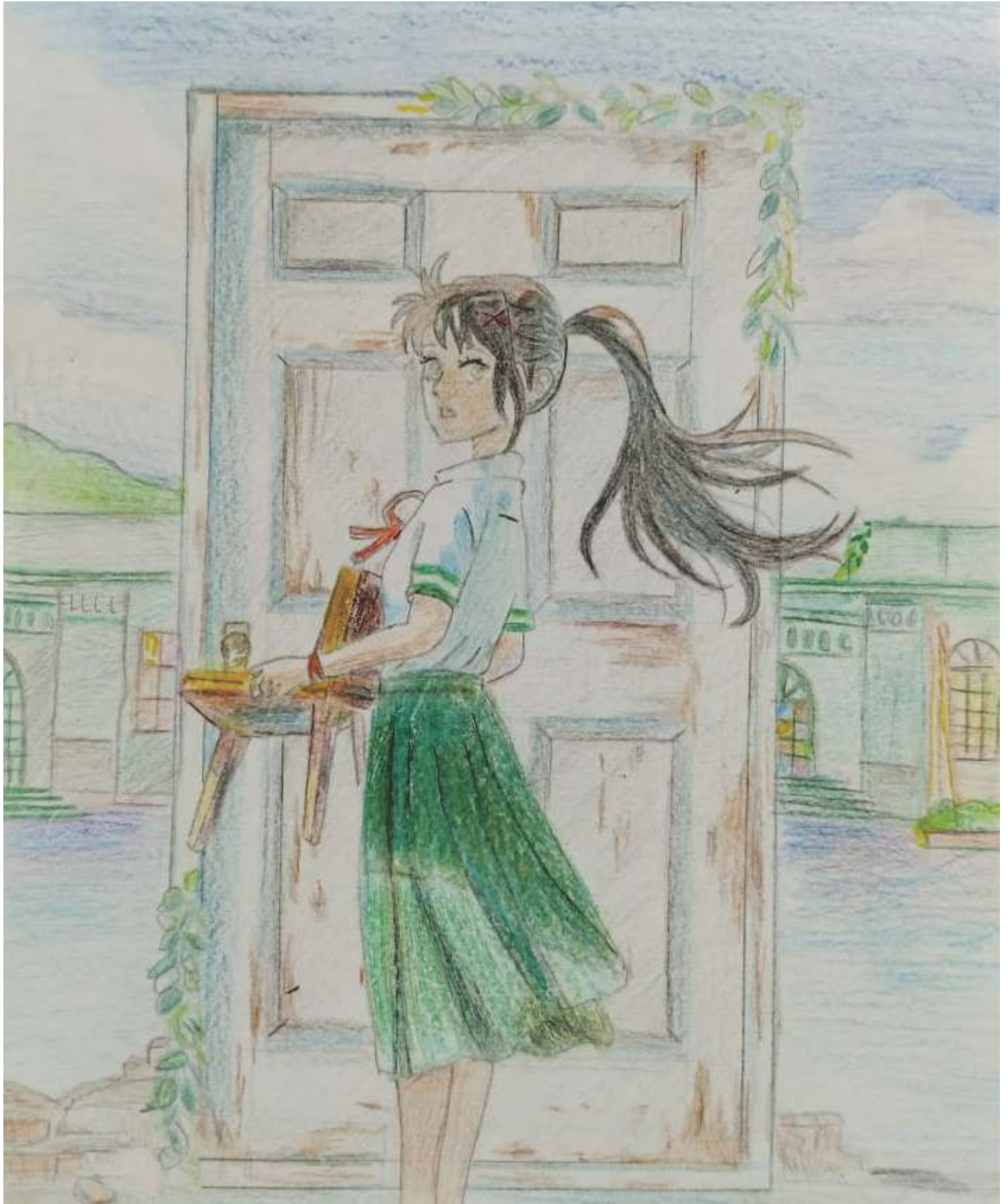
Saanvi Stuti Class 5 Sirius