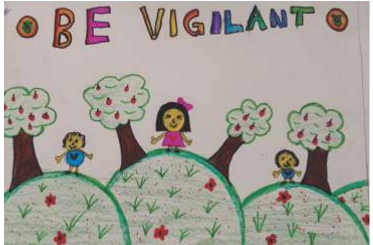
Avani Shelar 3 Sirius