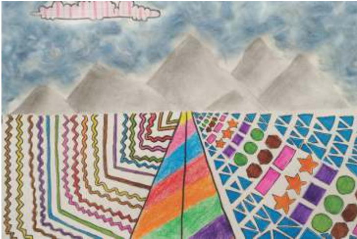
Anshita Gatey 7 Deneb