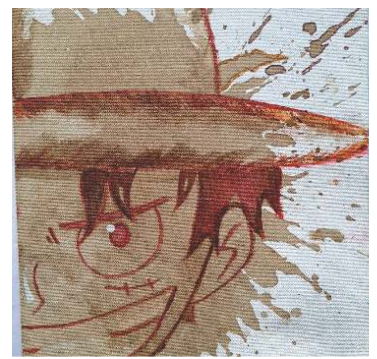
Dhruv Shrivastava 7 Rigel