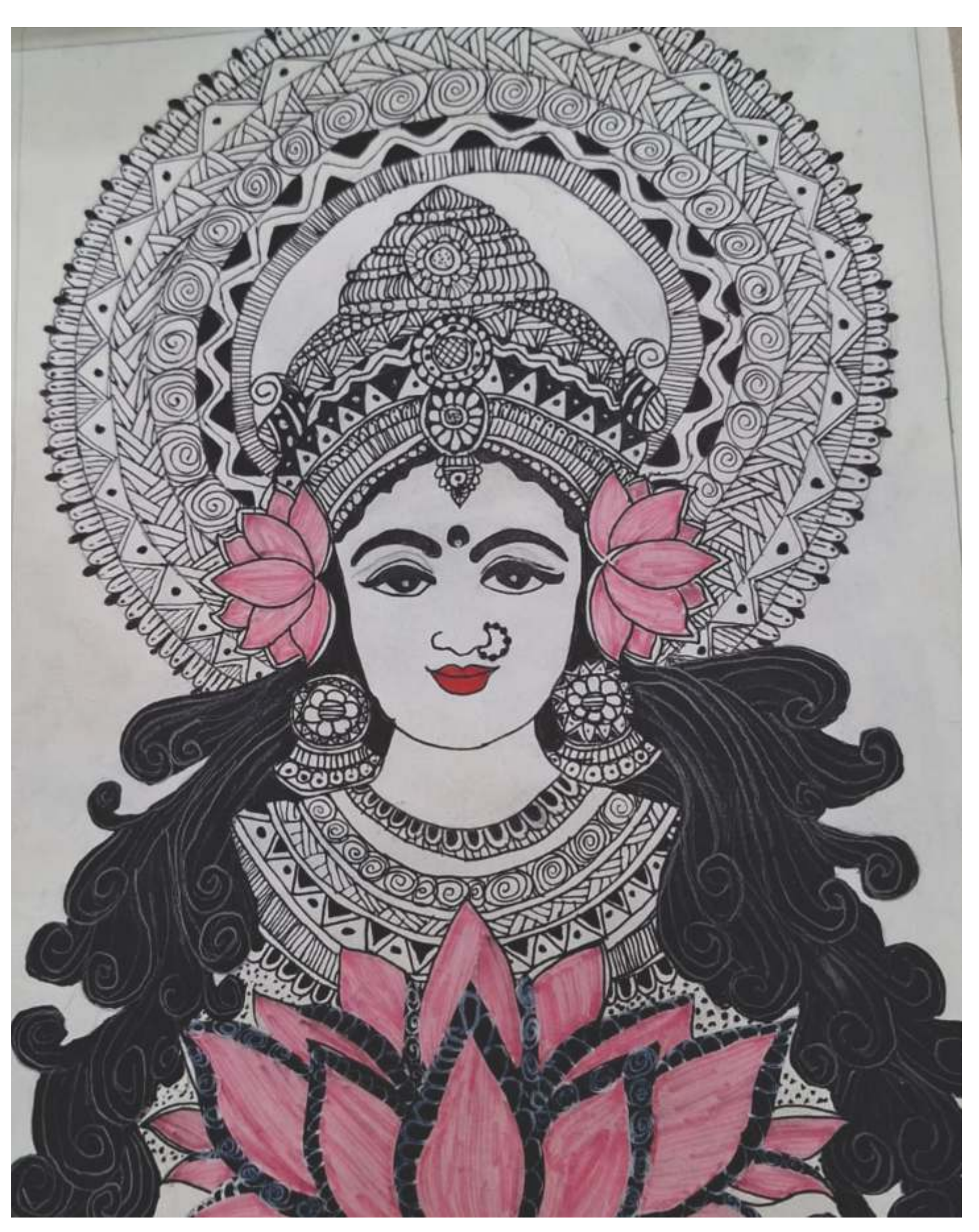
Sanvi Katre 7 Rigel