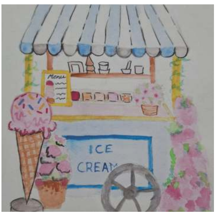
Dnyanada Patil 8 Sirius