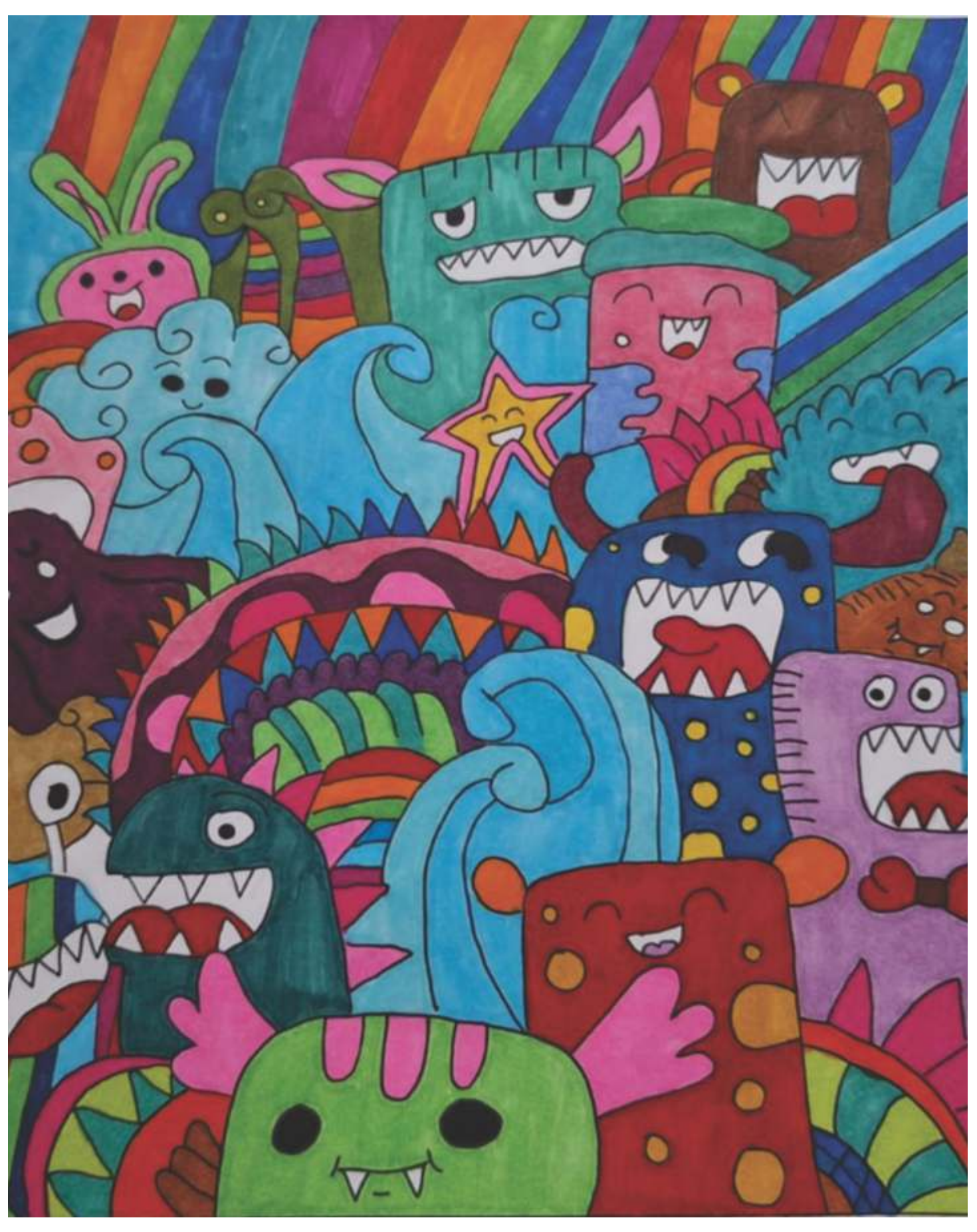
Cavin Karia 7 Rigel