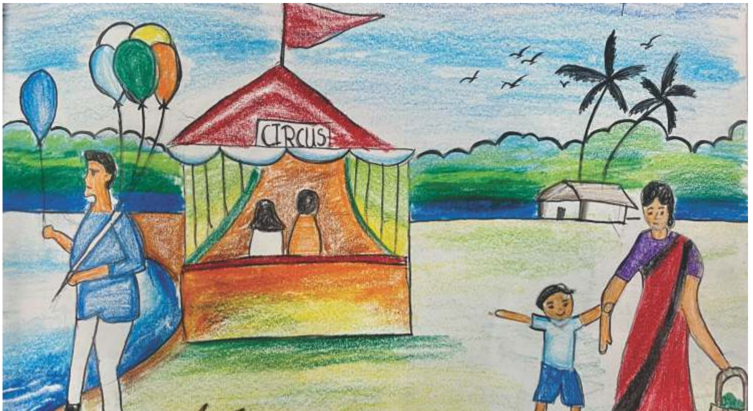
Hridhaan Das, Student 4 Sirius