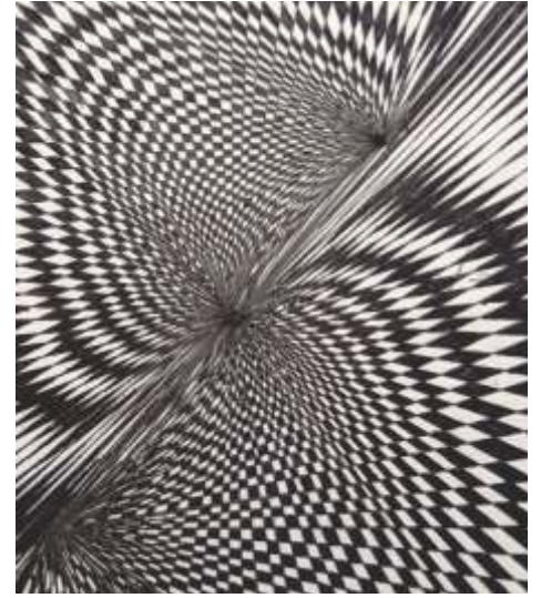
Rachit Bagla 6 Antares